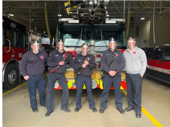
Face shields worn by fireman with the Bensenville Fire Protection District