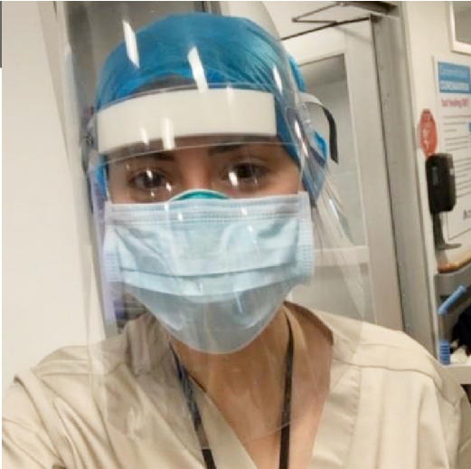
Face shield in use at Mount Sinai Queens Queens, NY